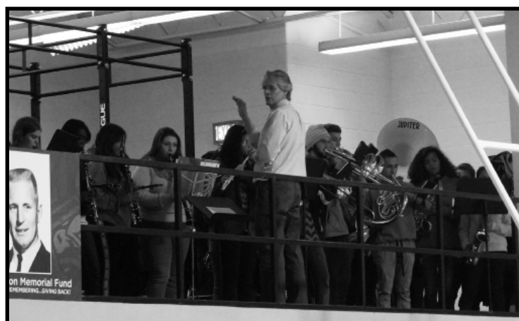
Viking Band and Concert Band join together to play during the Varsity basketball game.