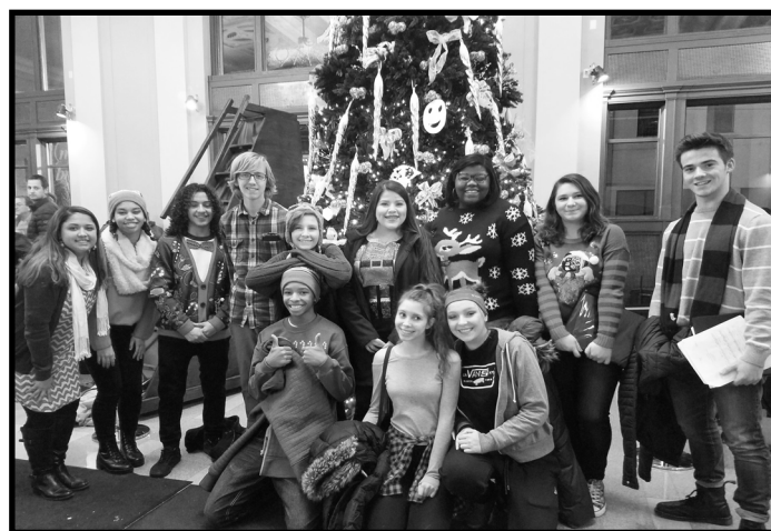
A Capella members posed after their performance in City Hall during Stroll on State.

Every year since they began, the #Harmonics have been featured at the Stroll on State festivities. They ring in the holiday season, performing songs such as "Have